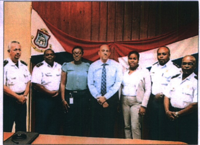
Police and St. Maarten Insurance Association representatives at the Philipsburg police station after announcing the intention to formalise the bill of sale for second-hand vehicles as of May 1.