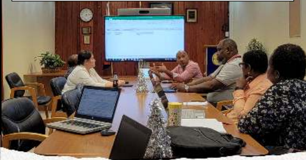
Placement Committee at work – December 2022