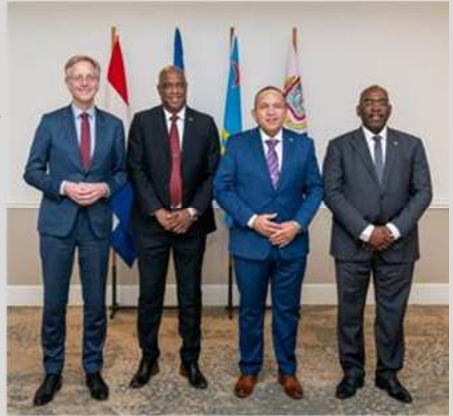
Ministry of Education, Culture, Youth and Sport